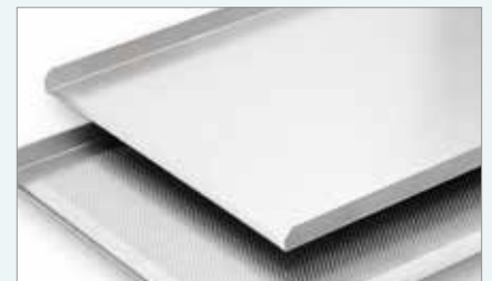
Stock baking trays